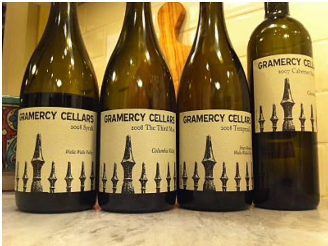
2007 Gramercy Cellars Cabernet Sauvignon

If you want to read the whole review you can check it out at Gramercy Cellars , but here are some quick ratings: